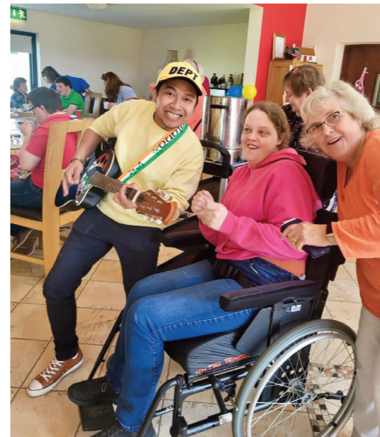
Members of Ballyhaunis Faith & Light group enjoying their summer Fiesta. Members of local music group "Le Cárde" provided music and entertainment.