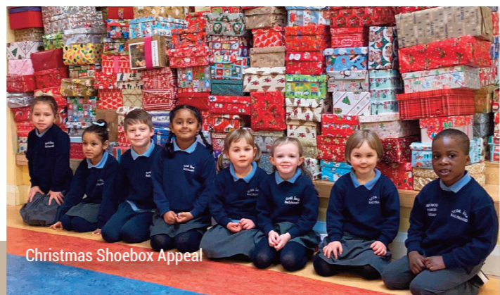
Christmas Shoebox Appeal