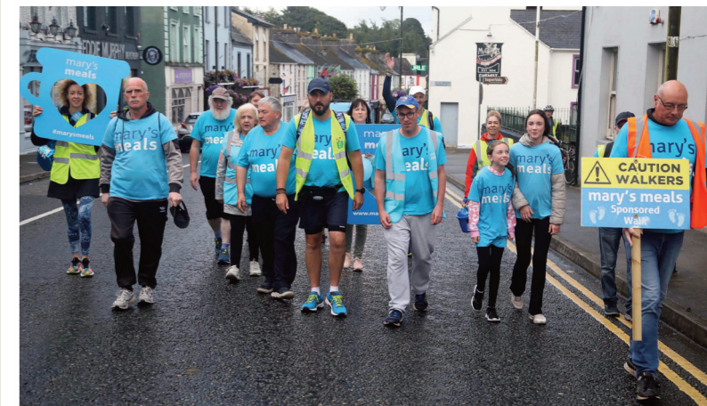
Volunteers from Mary's Meals leave Ballyhaunis on foot on the final leg of their pilgrimage to Knock on August 15th.