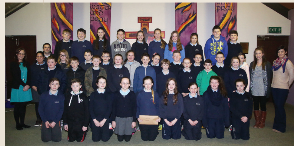
Confirmation Retreat with members of Youth Ministry at Knock