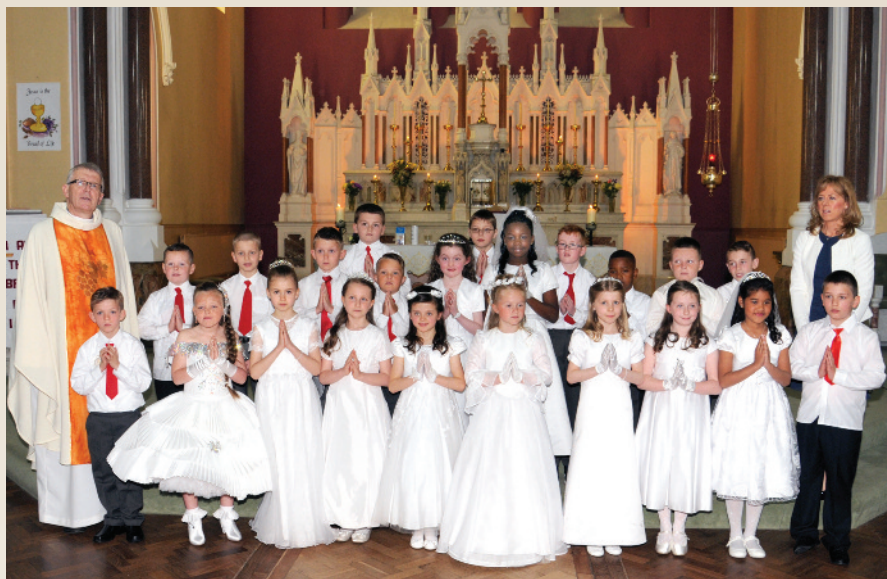
First Holy Communion, May 2015