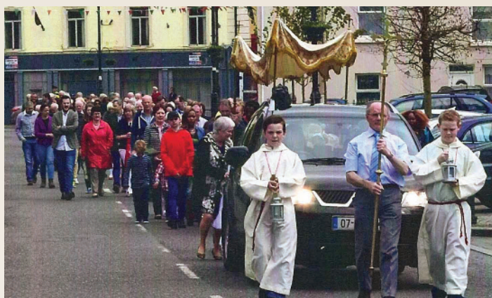
Corpus Christi Procession