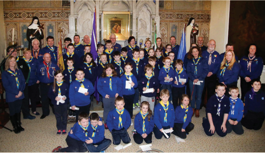
Ballyhaunis Scouts Investiture Ceremony

Meanwhile in the afternoon an Investiture Ceremony for the scouts took place in the Friary following an earlier decision to revive the movement. Photographs were taken afterwards and a most enjoyable day was had by all involved.