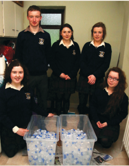
Members of the John Paul 2 Merit Award Students who filled the Holy Water bottles that were blessed on Holy Saturday night and distributed at all Masses on Easter Sunday.